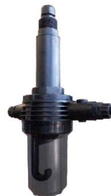
S461-LT with Flow cell