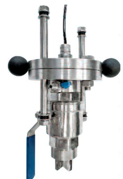
S305-INS probeholder for insertion into the pipe