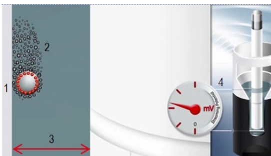
Figure 1: Inside the measuring cell

An accurate volume of an aqueous sample is placed in the measuring cell.